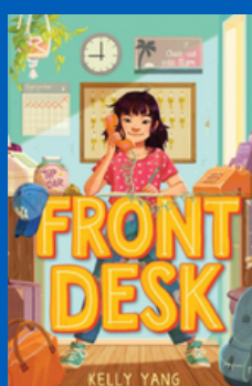
Front Desk by Kelly Yang