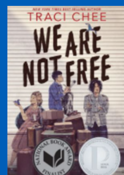
We are Not Free by Traci Chee